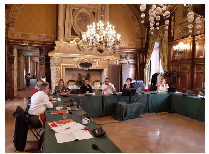
1/ Delice Network Executive Committee meeting September 2022 2/ Delice Network Executive Committee at work