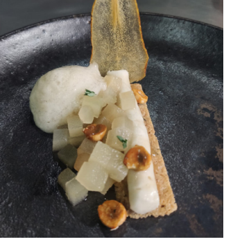
The ESHOB Schoool in Barcelona