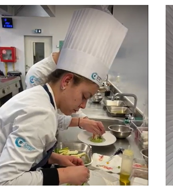
Campus du Lac in Bordeaux

Délice, as the lead partner, coordinates and organizes the project «The Future in our Kitchens: Social & Sustainable Skills for Culinary Trainees,» funded by the European Erasmus+ program. Started in September 2022, Future Kitchens aims to open the mindset of future cooks and food entrepreneurs through an international cooperation partnership between vocational culinary training institutes for the school year 2022-2023. It involves five Culinary institutes from Délice cities: ESHOB (Barcelona), Campus Du Lac (Bordeaux), Gasmek (Gaziantep), Malmö Stad (Malmö), and IP Colombatto (Torino).