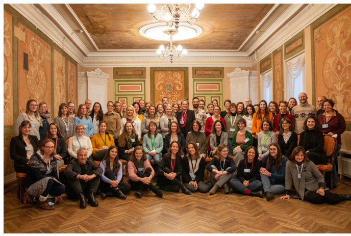
School Food for Change General Assembly in Tallin

first General Assembly in November Tallinn and developed Whole School Food Approach guidelines and concepts.